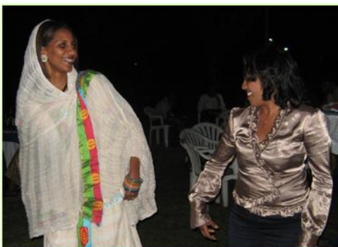
EASSI members from Eritrea and Ethiopia take time off to relax after the Strategic plan

“...And, as we let our own light shine, we consciously give other people permission to do the same. ...” Nelson Mandela