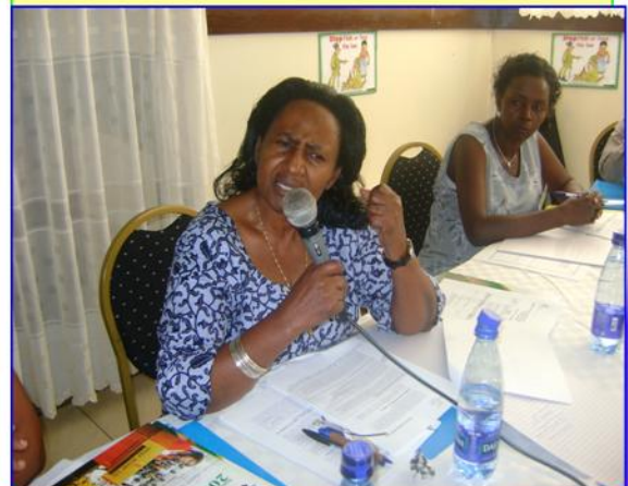
A participant from Tanzania Coalition for FGM stresses a point at the workshop