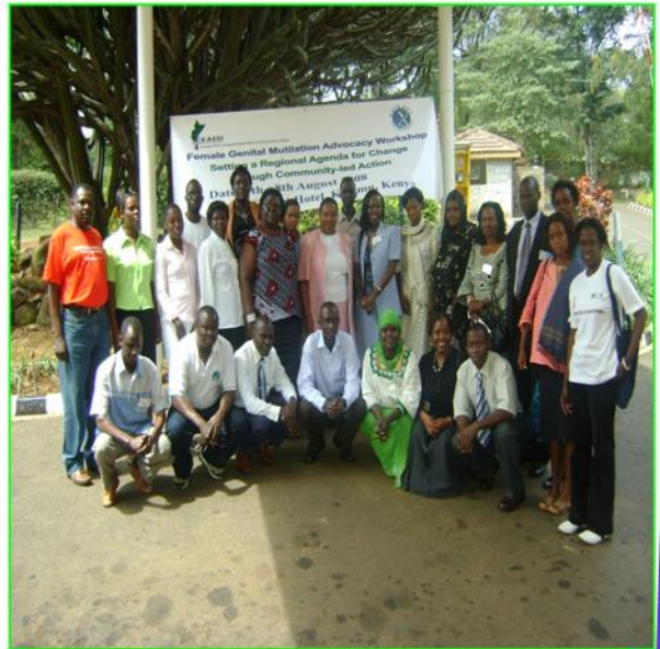
Participants in a group photo during the workshop

Partnerships with funding agencies. The meeting drew participants from the six countries in the EASSI sub-region in which FGM is practised namely Eritrea, Ethiopia, Kenya, Somalia, Tanzania and Uganda. The meeting discussed progress made and challenges faced in carrying out anti-FGM work and strategies to mitigate the challenges. The participants shared knowledge on good practices and generated information for regional campaign strategy for the elimination of FGM and identified funding opportunities for anti-FGM.