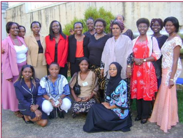
Board members and staff at Strategic Plan July 2008

HAPPY 1ST BIRTHDAY. MAY U GROW WITH THE STRENGTH OF A WOMAN.